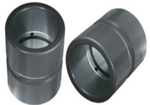
Thin Wall Bearings