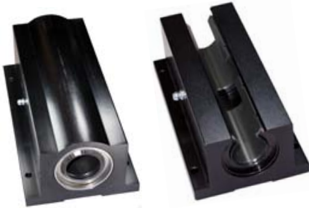
Closed & Open Twin Pillow Blocks