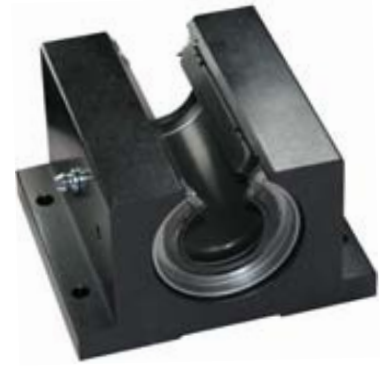
Single, Open Pillow Blocks