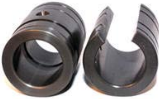
Closed & Open